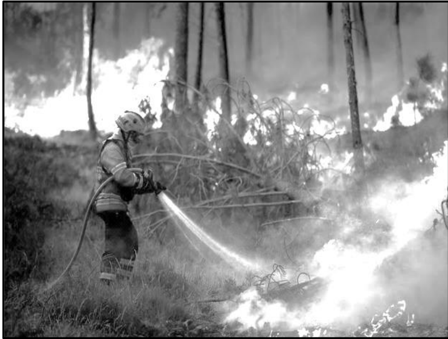
[Sicashunwe ku- www.googlepics.com ]