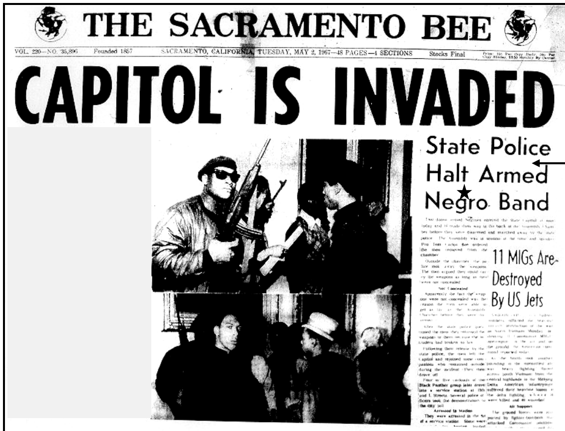
[From http://legallacuna.wordpress.com/2012/06/07/prospecting-in-the-martial-imaginary/ . Accessed on 20 September 2017.]

The source below is taken from a Californian newspaper, The Sacramento Bee , which was published on 2 May 1967. The headline reads: 'CAPITOL IS INVADED' and the subheading reads: 'State Police Halt Armed Negro ★ Band'.