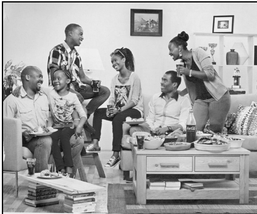
[Itsetfwe ku-Bona, Inhlaba 2013, Likhasi 25]

1.2.1 Khetsa KUNYE kuloku lokulandzelako. Nangabe ubuka lomndeni kulesibonwa lesingenhla ukhombisani emphilweni?