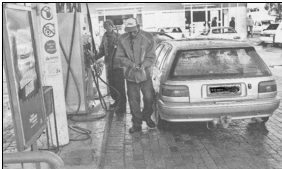
[Se qotsitswe koranteng ya The Star , Loetse 2013]

1.8 Sheba setshwantsho mme o qoqe ka seo setshwantsho se se qholotsang maikutlong a hao. Neha moqoqo wa hao sehlooho.