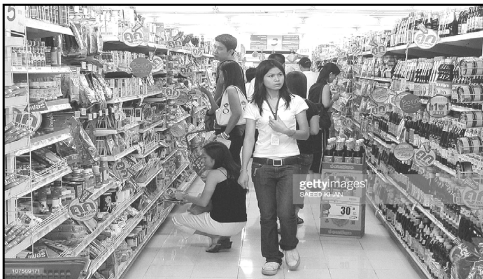
[Se qotsitse le ho lokiswa ho tswa http://m.theglobeandmail.com ]