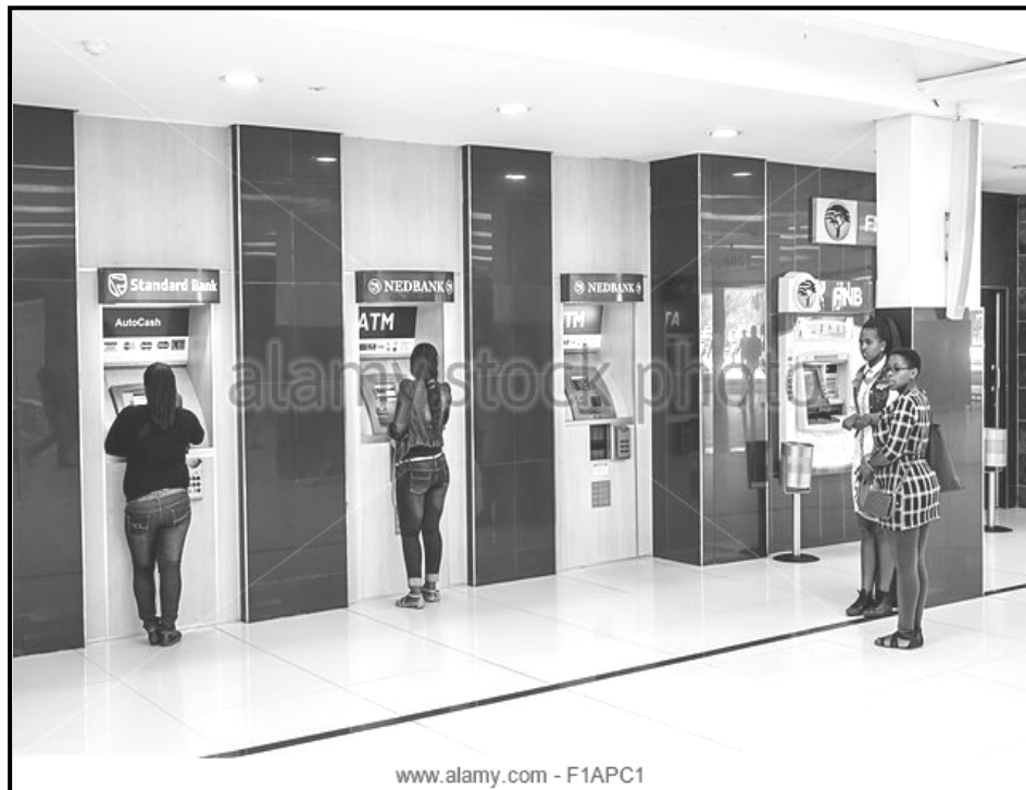
[Se qotsitse le ho lokiswa ho tswa http://www.google.co.za ]