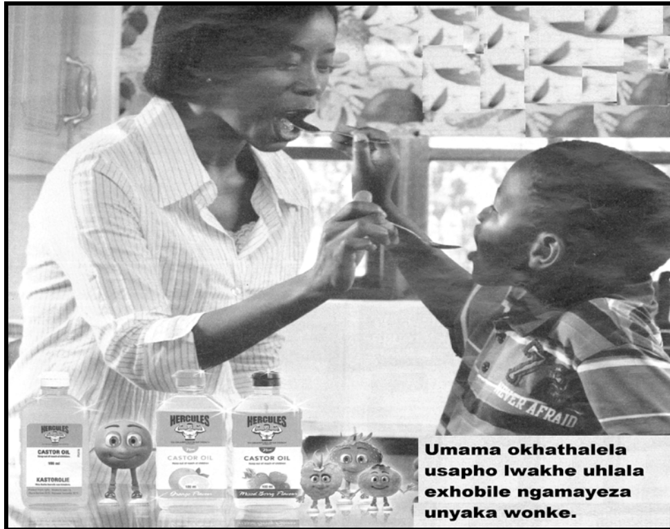
[Uthathwe kwiBona; Julayi 2012, iphepha 81.waze wahlelwa]