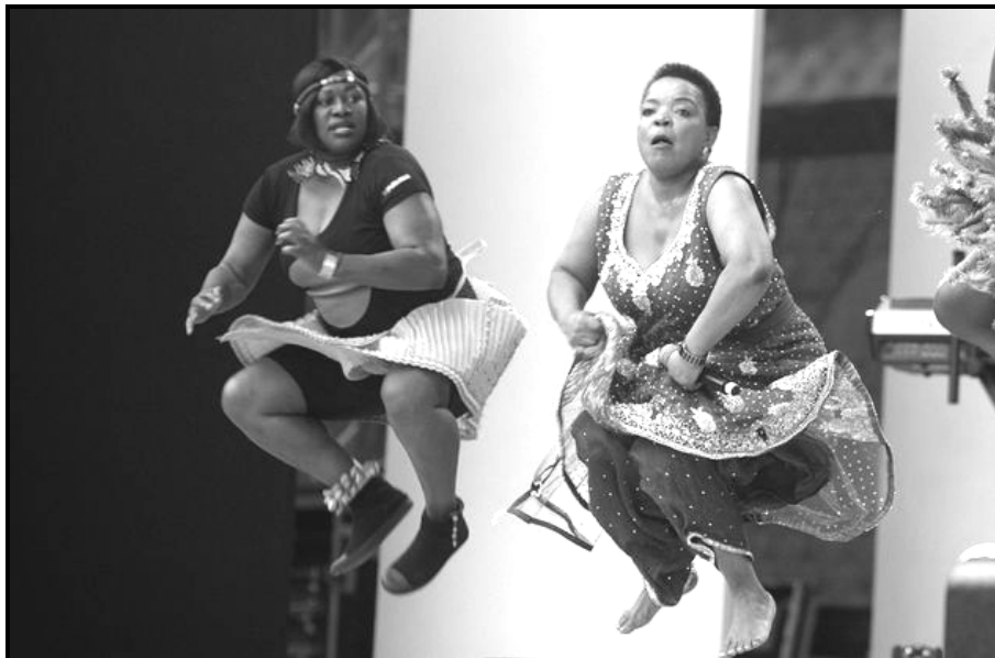
[Ithathwe kwi-Intanethi yaza yahlelwa]

5.2 Jonga lo mfanekiso uze uphendule imibuzo elandelayo.