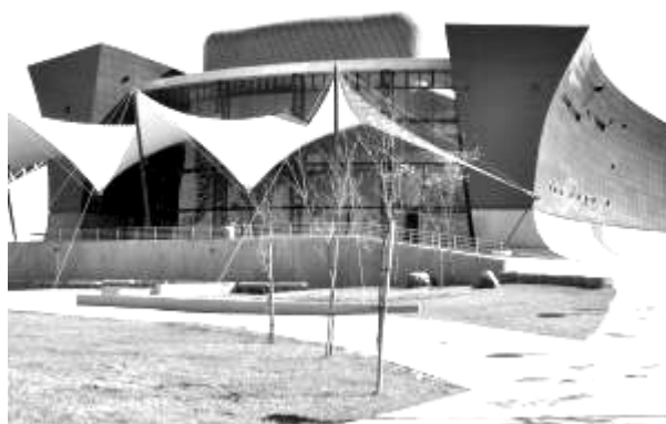
The outside of the theatre

The new theatre resembles a giant toy with walls clad in bright blue, yellow and red tiles and a tent-like entrance covered in an awning of white canvas. Sophisticated and modern, it contrasts sharply with the community halls where plays in Soweto were once performed. There was just one bit of advice for the new theatre's management: 'Please, no weddings and parties!' The manager wants a stage devoted to theatre where audiences can see sophisticated and challenging work.