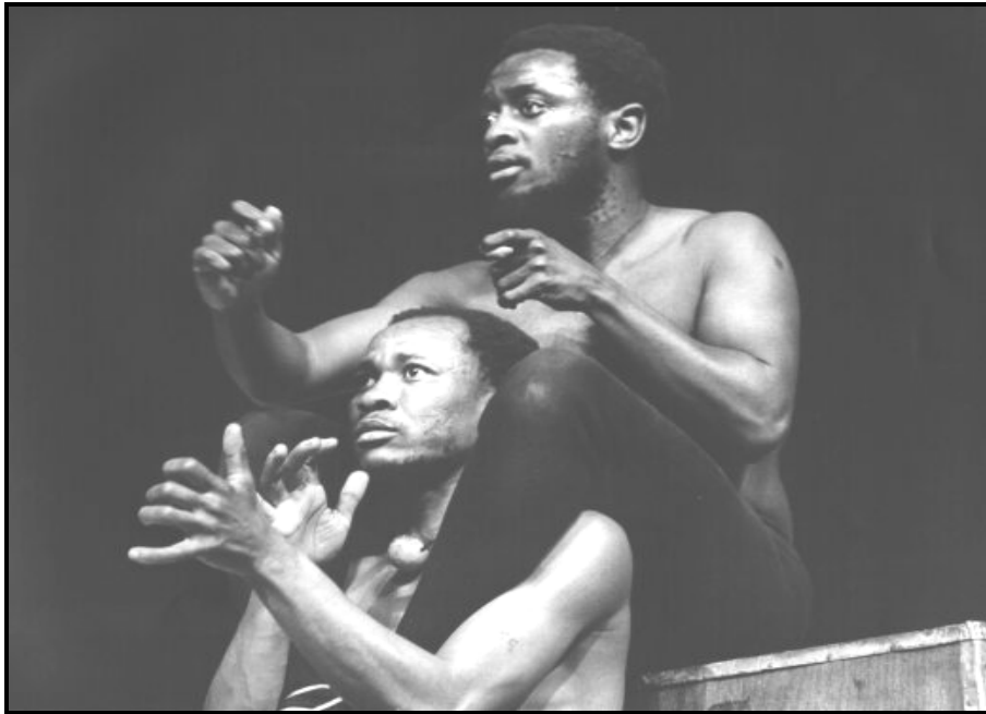
The original cast of Mbongeni Ngema and Percy Mtwa in a production of Woza Albert!