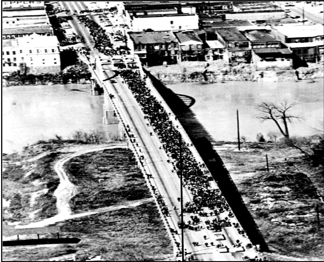
Thousands of civil rights activists are seen crossing the Edmund Pettus Bridge.

Visual Source: This is an aerial view of the civil rights activists crossing the Edmund Pettus Bridge during the march from Selma to Montgomery, Alabama on 7 March 1965.