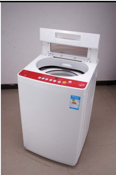
FIGURE 1: Sharp top-loader washing machine