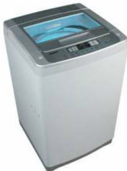
FIGURE 2: Siemens top-loader washing machine